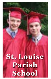
St. Louise Parish School