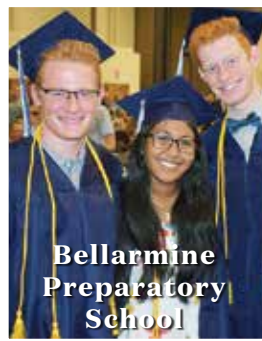
Bellarmino Preparatory School