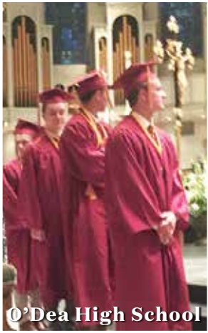
O'Dea High School