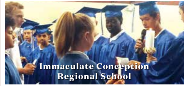
Immaculate Conception Regional School