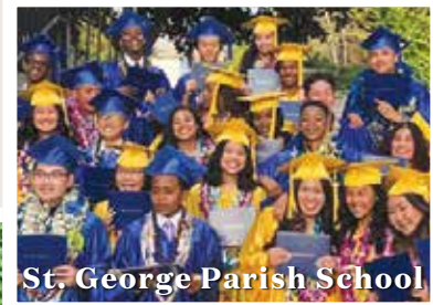
St. George Parish School