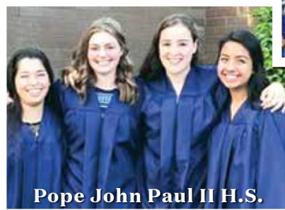
Pope John Paul II H.S.

Last year, the Archdiocese of Seattle graduated 1,373 students from its Catholic high schools, and 1,550 students from its Catholic middle schools and of those, 954 went on to attend Catholic high schools. Numbers for the 2017/18 academic year are still being calculated.