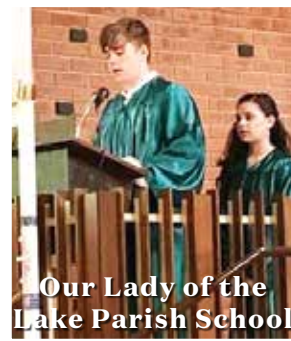
Our Lady of the Lake Parish School