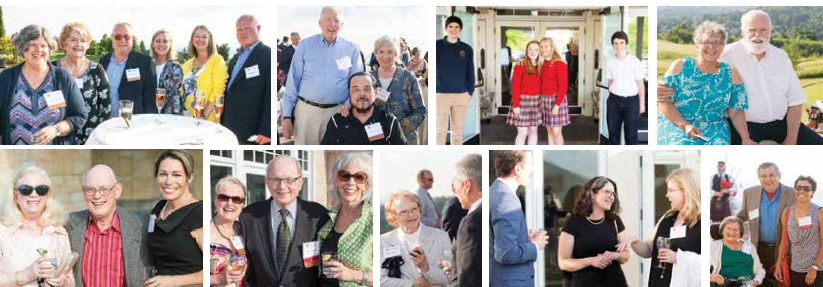
See more 2018 Chairman's Circle Dinner photos on Facebook at www.facebook.com/fulcrumfoundation .